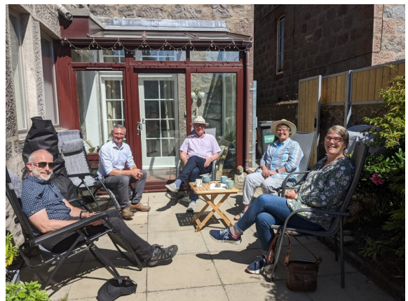
Preparing services together– from L-R