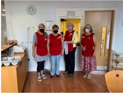
The Hub Café at Cults Church