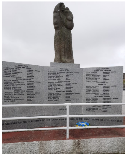
Gloop Disaster Memorial