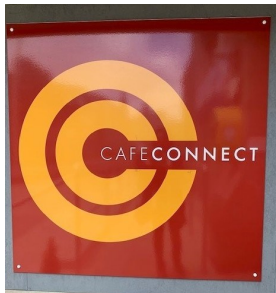
The Connect café at Mannofield Church plus a weekly banking service