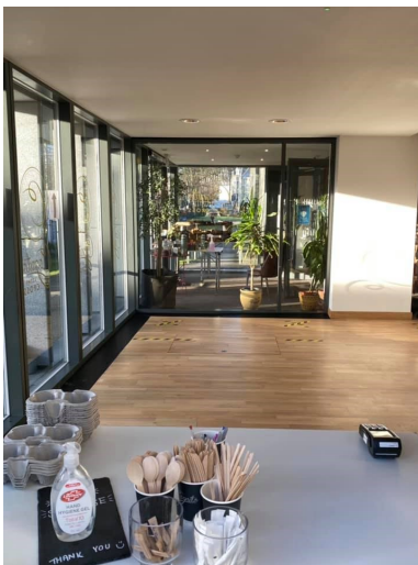
Cognito at the Cross– The café at Queens Cross Church