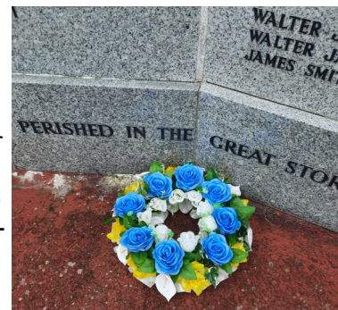
Wreath laid at the Memorial Service on 20th July 2021

How did so many fishermen die that night? Six of the 10 boats that travelled out were small boats called 'sixareens' which were multi compartment boats with oars and were common from the 1700s for 'haaf' fishing. Haaf fishing was a system whereby land stations processed and salted the fish for export. The entire community were involved, from small children to the very old. These small boats travelled out 40 miles into the fishing grounds but were not suitable for navigating these open seas. For days before their fateful journey strong winds had kept them on-shore but the morning of 20th July looked fine and calm. The crew thought it was a good day and set off. The navigation systems were primitive and relied on recognisable landmarks. They had no way of knowing a storm was brewing from Iceland at a storm force 10. It took them by surprise and they tried to make it back to the shore but sadly many boats overturned. This day was later to be known to locals as the 'day atween wadders'. The skippers who did return to shore searched for their colleagues but could not help them. They kept their own crews safe by demonstrating skilled sailing, negotiating heavy seas, to reach home. The bodies of seven men were found. Over half the fisherman came from the village of Gloop. The name 'gloop' refers to a jet of water penetrating land through a sea cave.